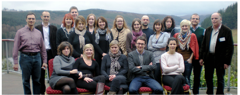
> I-SPEED team at Lake Vyrnwy

The experience of tourism providers, collecting their customer valuation, will be overcome by social networking as main source for knowing the reality of