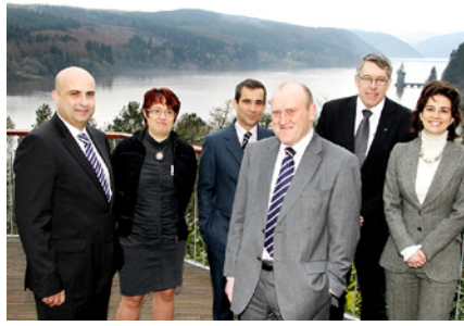
➤ PSG members in Powys

It's very important to stress that political representatives (many of them will end their commitment before 2015) put at the first place, in 2015, their community well being and the quality of living for all the populations in their region or city. This is not so banal in a project that has the SMEs in tourism sector as a main target. We dare say that a new sensibility is coming on in EU to the core of tourism sustainability: the best reciprocal effects between visitors and inhabitants, and vice versa. In other words I-SPEED partners do not seem hard-tourism fans, but quality of place caretakers.