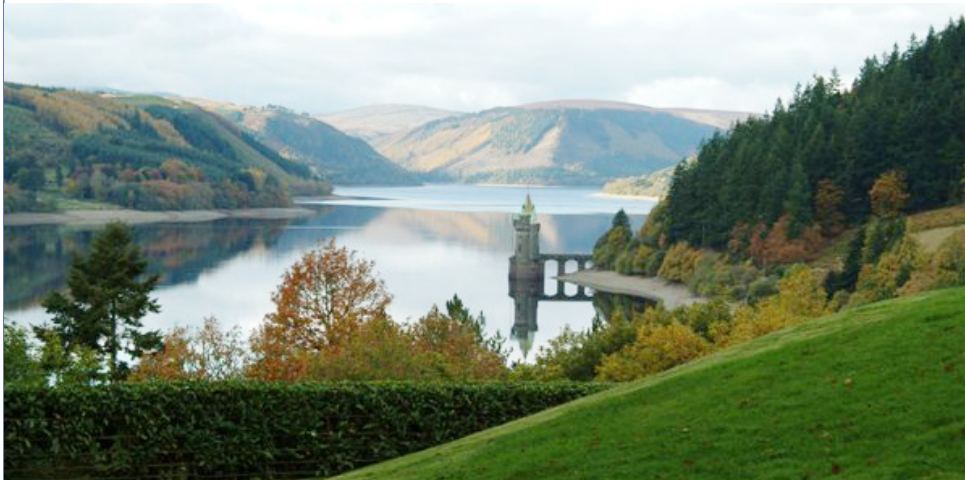
&gt; Lake Vyrnwy