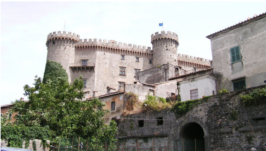
> Bracciano Castle

The third I-SPEED workshop will be held in the Province of Rome from May 25th to May 27th 2011 and it will be dedicated to analyse I-SPEED good practices identified and described in the Good Practice Guideline.